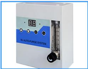
❖ Independent Nitrogen purge system (Model TN2-02)

Alarm light flashes and sounds when its internal humidity exceeds set value