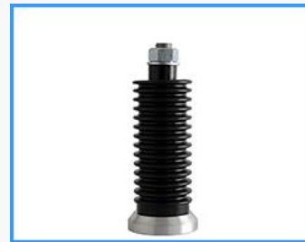
❖ Adjustable legs

Effective usage of N 2 combined with Super Dry, help to accelerate the recovery time and oxidation prevention. Set on digital control panel