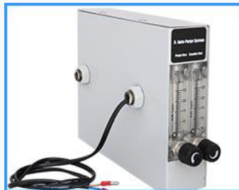
❖ Nitrogen auto purge system (Model AN2-03)

Simple N 2 flow meter 0-25L/min adjustable