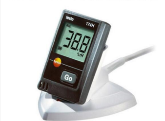
❖ Data logger with software (model MR174H)

Data logging humidity and temperature, can read and output data by software with a PC