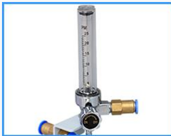
❖ Nitrogen valve (Model: HN2-01)

Effective usage of N 2 combined with Super Dry, help to accelerate the recovery time and oxidation prevention. Set the buttons on N 2 purge system itself