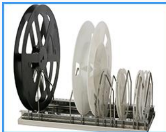
❖ SMD single rack (stainless steel)

Greatly increase the usable space inside Super Dry