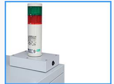
❖ Humidity alarm light

Alarm buzzer sounds when its internal humidity/ door open time exceeds set value