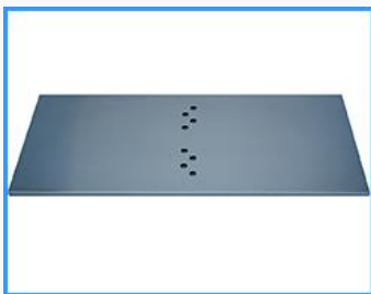
❖ Extra shelf

Greatly increase the usable space inside Super Dry