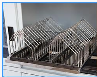
❖ SMD double rack (stainless steel)

Suitable for storage of components on tape and reel, can pull out on rail