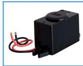
❖ Humidity/ Door open alarm buzzer

Suitable for storage of components on tape and reel, can pull out on rail